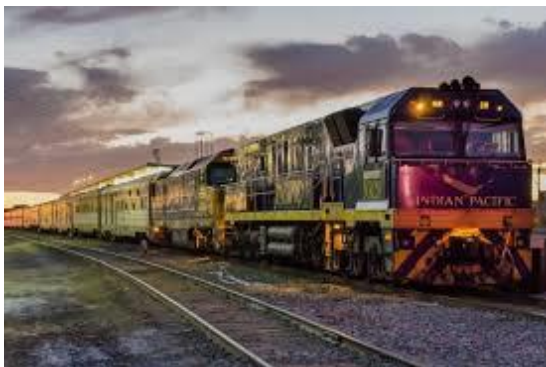
Indian Pacific – A world class train

Solo & Single fares from $8,789 per person