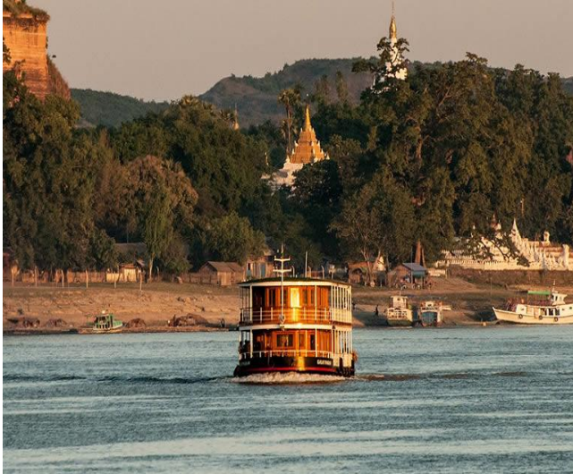
RV Orient Pandaw